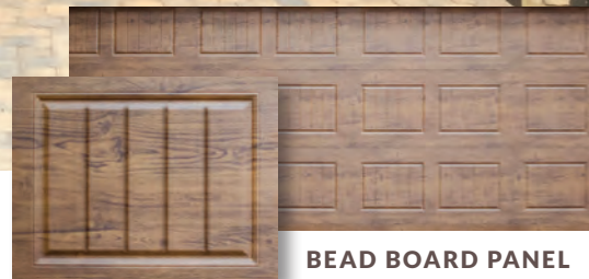
BEAD BOARD PANEL