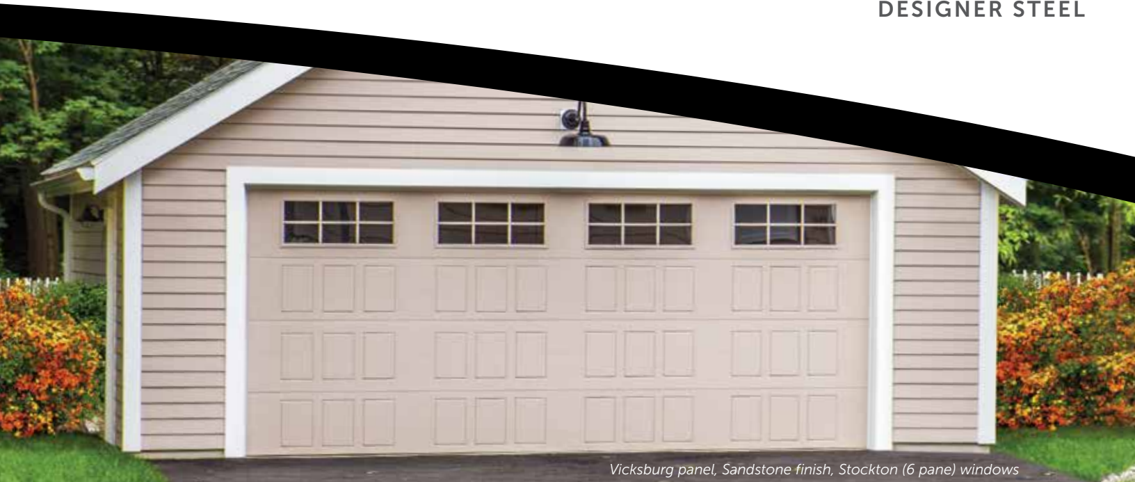
Vicksburg panel, Sandstone finish, Stockton (6 pane) windows