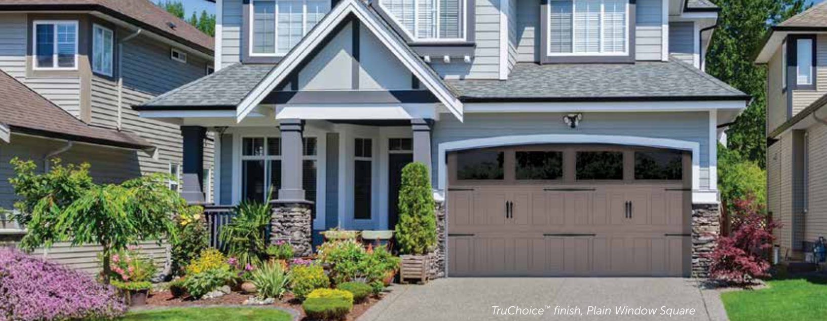
TruChoice™ finish, Plain Window Square